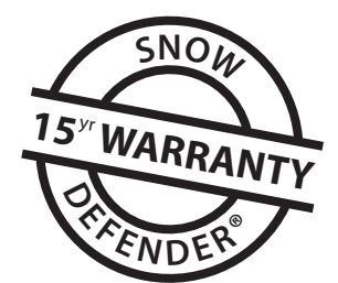
For warranty details visit www.snow -defender.com

Failure to install an adequate amount of snow guards and in the proper pattern will void the warranty. Visit www.snowdefendercalculator.com to use our snow guard calculator to determine the amount needed.