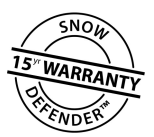
For warranty details visit www.levisbuildingcompo nents.com/warranties

Failure to install an adequate amount of snow guards and in the proper pattern will void the warranty. Visit www.snowdefendercalculator.com to use our snow guard calculator to determine the amount needed.